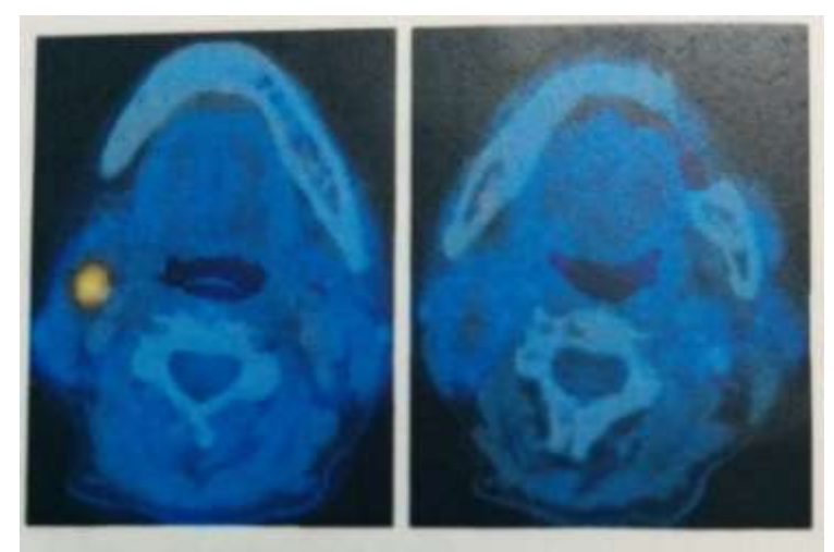
Figure 2: PET CT showing metastatic deposits in contralateral level 2 neck lymph nodes