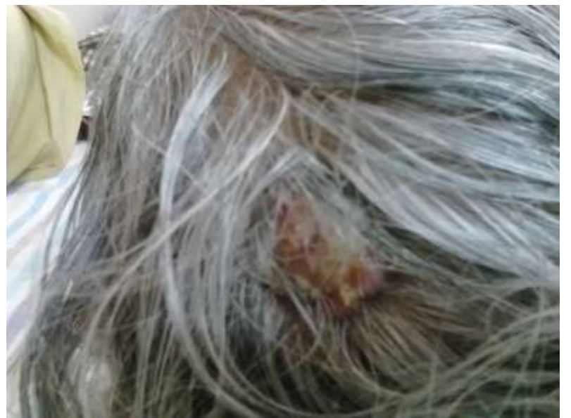
Figure 3: Shows cutaneous metastasis in the scalp