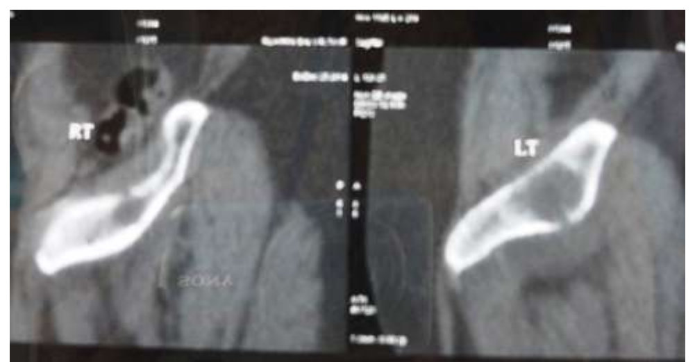
Figure 4: CT scan of the pelvis shows metastases in alae of both iliac bones